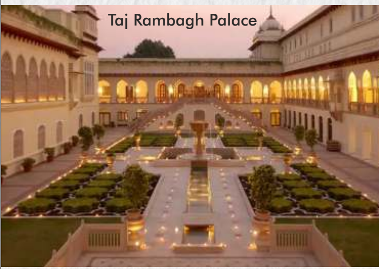
Taj Rambagh Palace